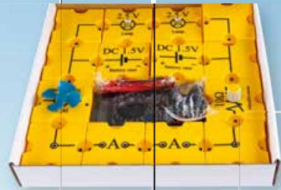
Block Circuit Board HG 0005

A demonstration set of electric circuits. • size: 36 x 36 x 5.5 cm