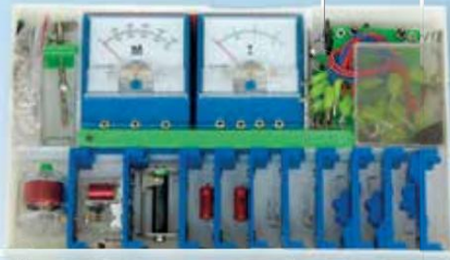
Experiments with electricity QH 0033