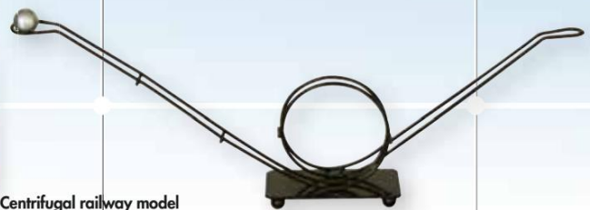
Centrifugal railway model QH 0051

A centrifugal force demonstrator. The model consists of a metal rail forming a large loop at the base (and with a guide track on the inside). A ball released at the elevated starting point defies gravity when reaching the top of the loop and leaves the loop still within the track.